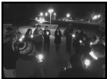
Sleep-out for Homelessness