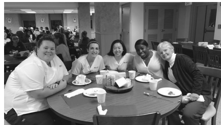
National Catholic Sisters Week Celebrations!