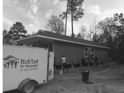
Spring Break Habitat for Humanity Trips in Beaufort, SC and Mandeville, LA!