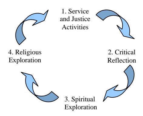
DIAGRAM 2: From Service Involvement to Spiritual Exploration

While these activities offer campus religious leaders a powerful means to involve "spiritual but not religious" students in service learning and spiritual exploration, there is one risk to employing this model. If too much time and energy are devoted to the coordination of service and justice projects, less emphasis may be placed on reflective activities that help students deepen their religious and spiritual values. Alden and Rutledge describe the Praxis Project as a curriculum designed to develop the Christian faith. Yet, there is always an inherent risk that such projects will evolve into purely secular endeavors. The academic objectivity of the college classroom has the potential to weaken, if not totally eliminate, the opportunity for spiritual and faith formation. Faculty who partner with campus religious leaders might accept assistance with the coordination of service projects, but may not want religious or spiritual conversations to occur in their classrooms. If they simply become secular service learning coordinators, campus religious leaders will lose their capacity to present the messages of social change that arise from their particular faith traditions.