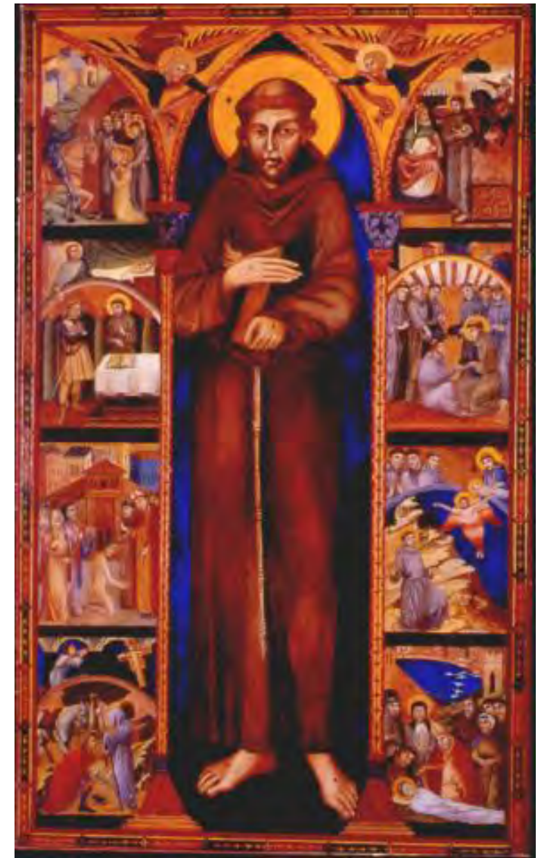
Tavola of St. Clare of Assisi