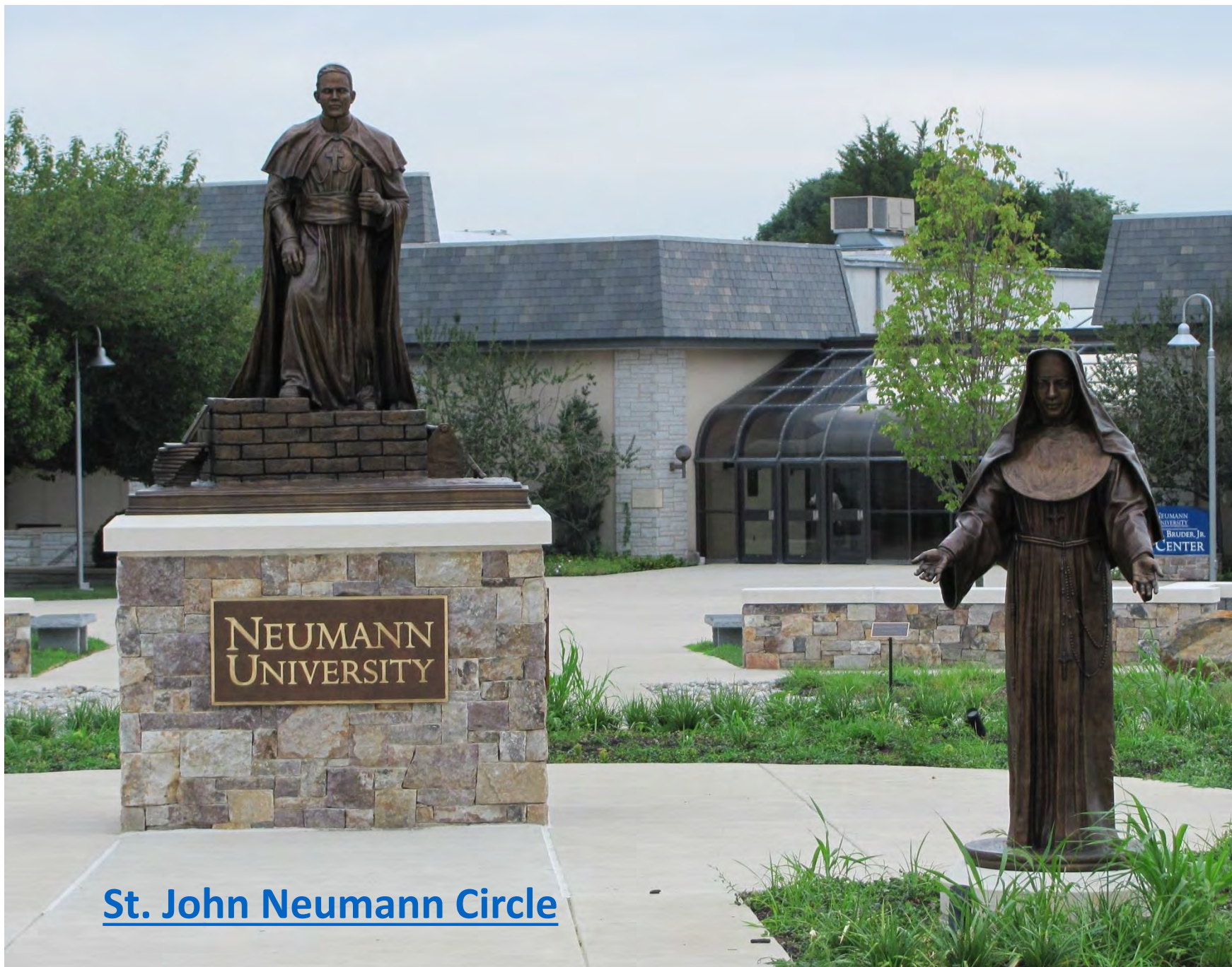
St. John Neumann Circle