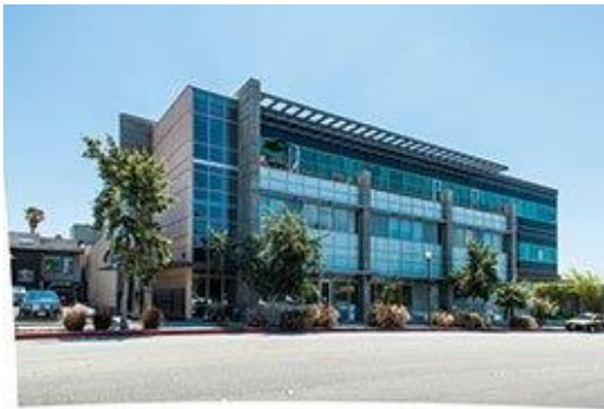
Palm Springs, California