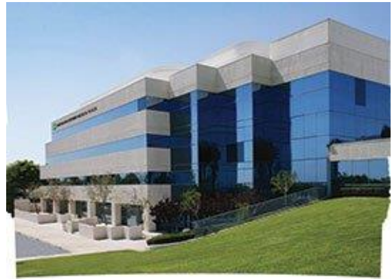
Mission Hills, California

City of Hope has additional locations across Los Angeles, Ventura, Riverside, Orange, and San Bernardino counties.