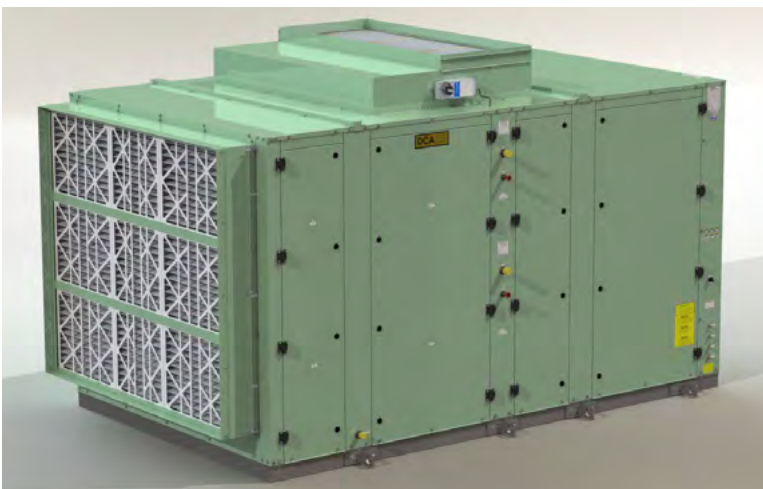
DCA 11000T AIR COOLED UNIT