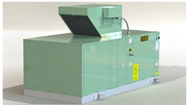
DCA 2500T AIR COOLED ROOF TOP UNIT WITH BOTTOM SUPPLY & RETURN

The best warranty in the industry, the highest quality components, built by American craftsmen, all at a competitive price, this is what we mean when we say, "Value Driven Quality, Built Here."