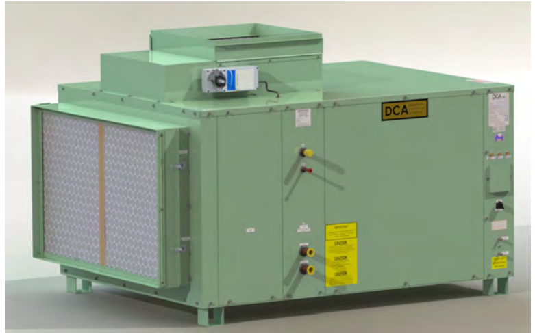
DCA 2500T-WH POOL WATER HEATING UNIT