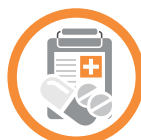
Medication Therapy Management (MTM)