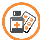
Admission & Discharge Medication Reconciliation