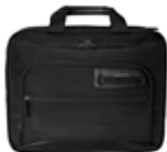
Elliot Deluxe Brief