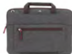
Collins Carry Case