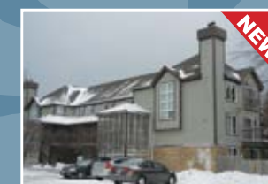
STEAL OF A DEAL 3 bdrm., 2.5 bath, 1335 sq. ft. Upper level, 2 storey in Lighthouse $215,000