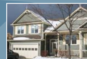
CONDO OR SKI CHALET? 4 bdrm., 3.5 bath, 2350 sq. ft. fin. Multi level space for the whole family $399,000