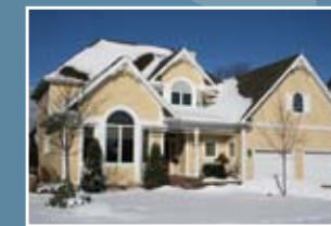
SHUTTLE TO THE VILLAGE 4 + 1 bdrm., 3.5 bath, 4491 sq. ft. fin. Custom built on Monterra Golf Course $1,095,000