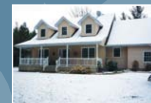
CUSTOM HOME IN COUNTRY SETTING 3+1 bdrm., 3.5 bath, 4582 sq. ft. fin. 3 car gar., Minutes to Osler & Collingwood $668,737