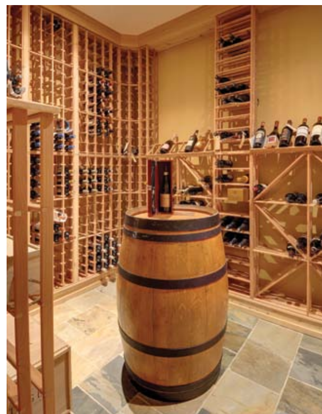
ABOVE: The girls’ kitchen is fully equipped with everything they need to host friends in their lower-level apartment. RIGHT: The newest addition downstairs is the wine cellar. Jens points out that several bottles have tags hanging around the bottlenecks with handwritten notes from the guests who gave them, including what foods to enjoy each vintage with.

The Jorgensen home was designed to be functional. The master bedroom and en suite are on the main level. Four more bedrooms and bathrooms (all countertops from City Stone ), a spacious living area and stone fireplace, wine cellar, kids’ laundry room, equipment/mudroom, steam/shower room and kitchenette are located in the fully finished lower level. Continued on page 58