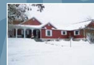
CUSTOM HOME ON 2.5 ACRES 3+2 bdrm., 3 bath, 4249 sq. ft. total Pool, workshop & potential in law suite $592,000