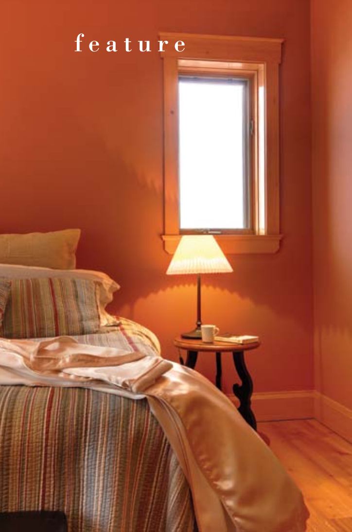
LEFT & BELOW: The guest room on the lower level is a private getaway for anyone staying with the Jorgensens. The bedroom is warm and comfortable in chalet colours while the spa-like en suite features double sinks, a spacious glassed-in shower and a large soaker tub.

The main floor features a remarkable open-concept space, which includes expansive kitchen, dining and living areas. The Jorgensens took full advantage of the post and beam construction to welcome in the light. Everywhere you turn, windows of all sizes offer breathtaking views of the surrounding valley.