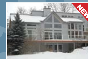
NIPISSING RIDGE CHALET 4 bdrm., 3.5 bath, 2587 sq. ft. Great family chalet near ski hills. $849,000