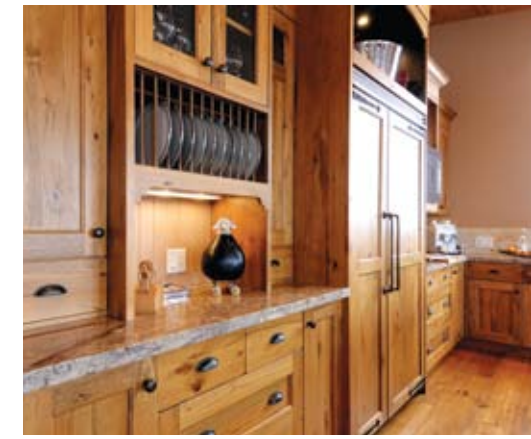
FAR LEFT: With the dinner table set for 10, complete with flower arrangements from Paperwhite Flowers in Thornbury, and a gourmet kitchen designed for entertaining, the Jorgensens are ready to share their evening with close friends. LEFT: After pouring a drink at the rustic bar in the dining room, visitors are encouraged to sign the guest book. TOP: An afternoon snack is served on a beautiful cheeseboard given to the Jorgensens as a gift from Eaton. ABOVE: The custom crafted kitchen offers loads of workspace and style with a built-in refrigerator.