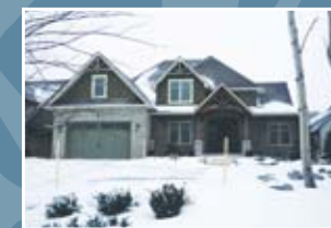
EXECUTIVE POST AND BEAM 5+2 bdrm., 6/2 bath, 8457 sq. ft. fin. Upscale interior finishes $2,449,000