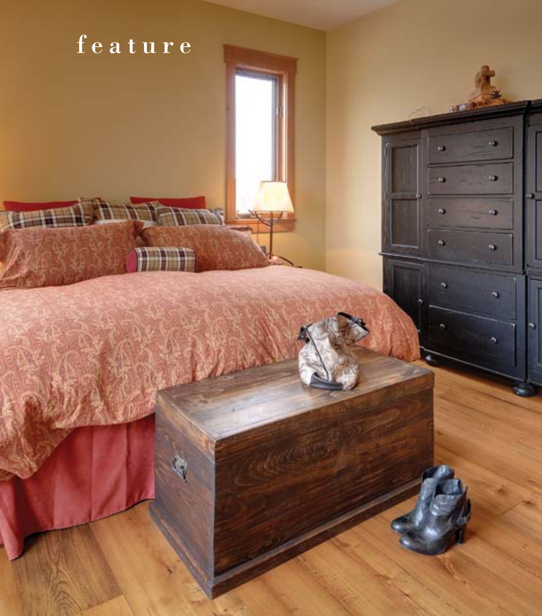
LEFT: Splashes of red are seen throughout the home, including in the cosy, up country master bedroom. BOTTOM LEFT: The master en suite mixes warm colours with clean lines and tasteful tile work to achieve a contemporary look that complements the rustic home. RIGHT: A wooden sign on the landing of the main staircase, pays tribute to the family's ski club, Georgian Peaks. FAR RIGHT & BELOW: The lower walkout level was designed specifically for the couple's three daughters with a large living room for playing games and watching movies, a small kitchen, a bedroom each, a separate laundry room, spa, gear room and a spare room for friends.