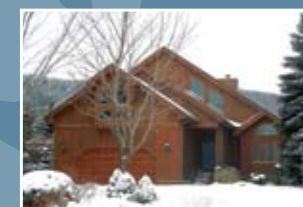
MOUNTAIN VIEW CHALET 4+2 bdrms., 4.5 bath, 3254 sq. ft. fin. Views, open concept, tons of space! $649,000