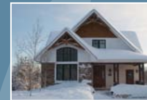
CHALET NEAR THE PEAKS 4 bdrm., 3.5 bath, 3690 sq. ft. Post & beam, walkout, mins. to Peaks $1,195,000