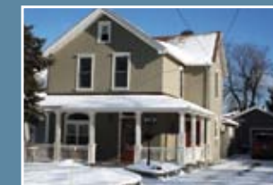
WALK TO TOWN 4 bdrm., 2.5 bath, 2165 sq. ft. Income apt + workshop + private lot $499,000

ExecuTeamAdvantage.com SellingCollingwood.com CollingwoodHomes.ca SellingBlueMountain.com