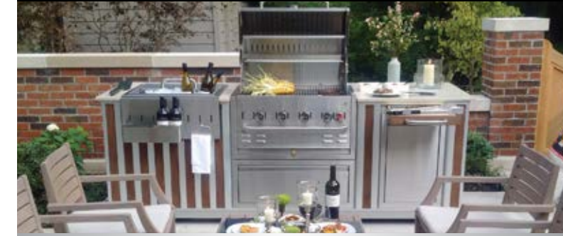
CUSTOM OUTDOOR KITCHEN & LUXURY CARTS