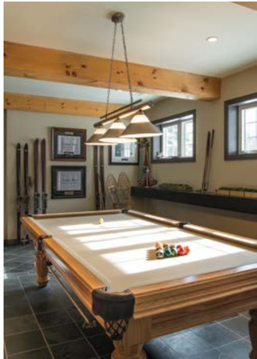
The recreation room on the lower level shows off some of the many ways the owners enjoy the region: golfing, snowshoeing, skiing and playing pool.