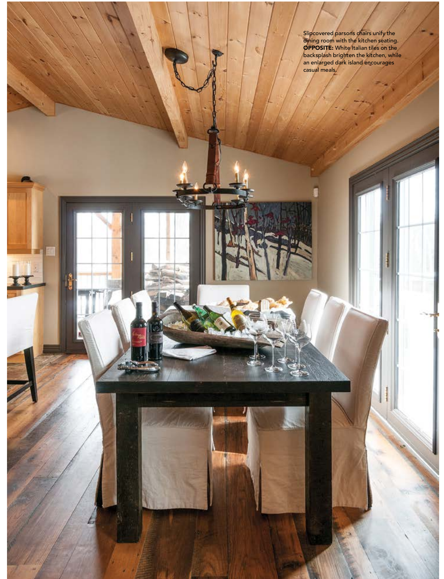
Slipcovered parsons chairs unify the dining room with the kitchen seating. OPPOSITE: White Italian tiles on the backsplash brighten the kitchen, while an enlarged dark island encourages casual meals.