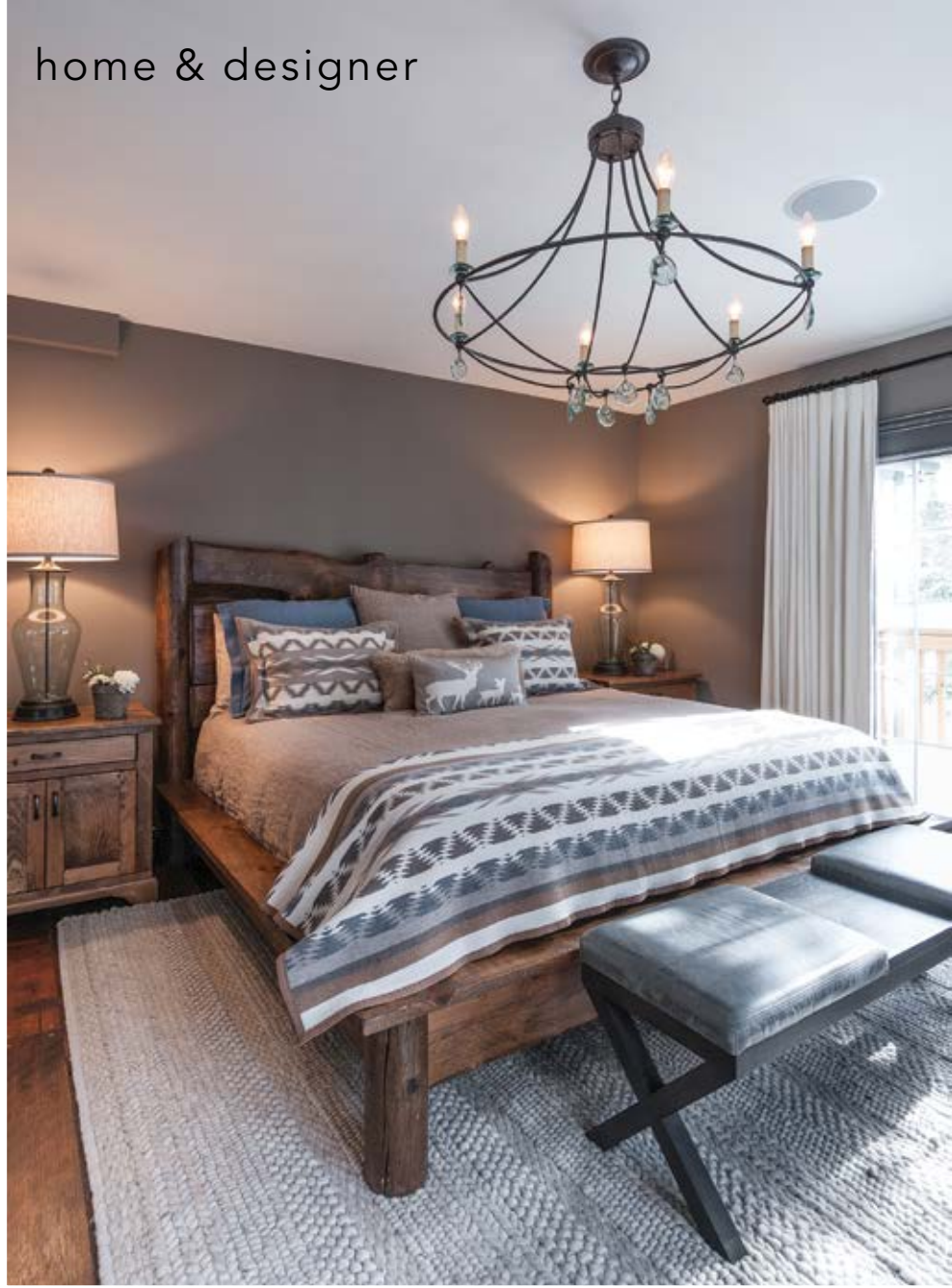
A large, airy chandelier in the master bedroom is a focal point. The master suite walks out to the deck with access to a hot tub, enjoyed by the owners après play.