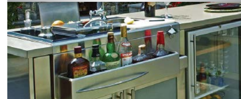
INDOOR OUTDOOR BAR/ENTERTAINMENT SYSTEMS