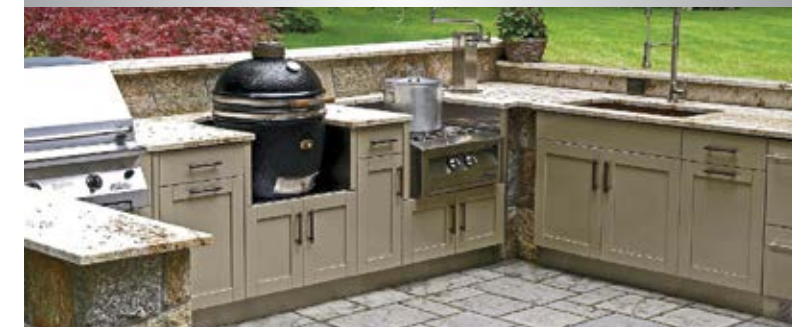
STAINLESS STEEL OUTDOOR KITCHEN CABINETS