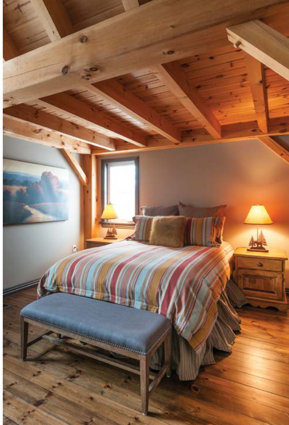
RIGHT: A guest room is warm with silhouette bedside lamps and a nailhead-trimmed ottoman. BELOW: A wine barrel finds new life as a sink in the powder room.