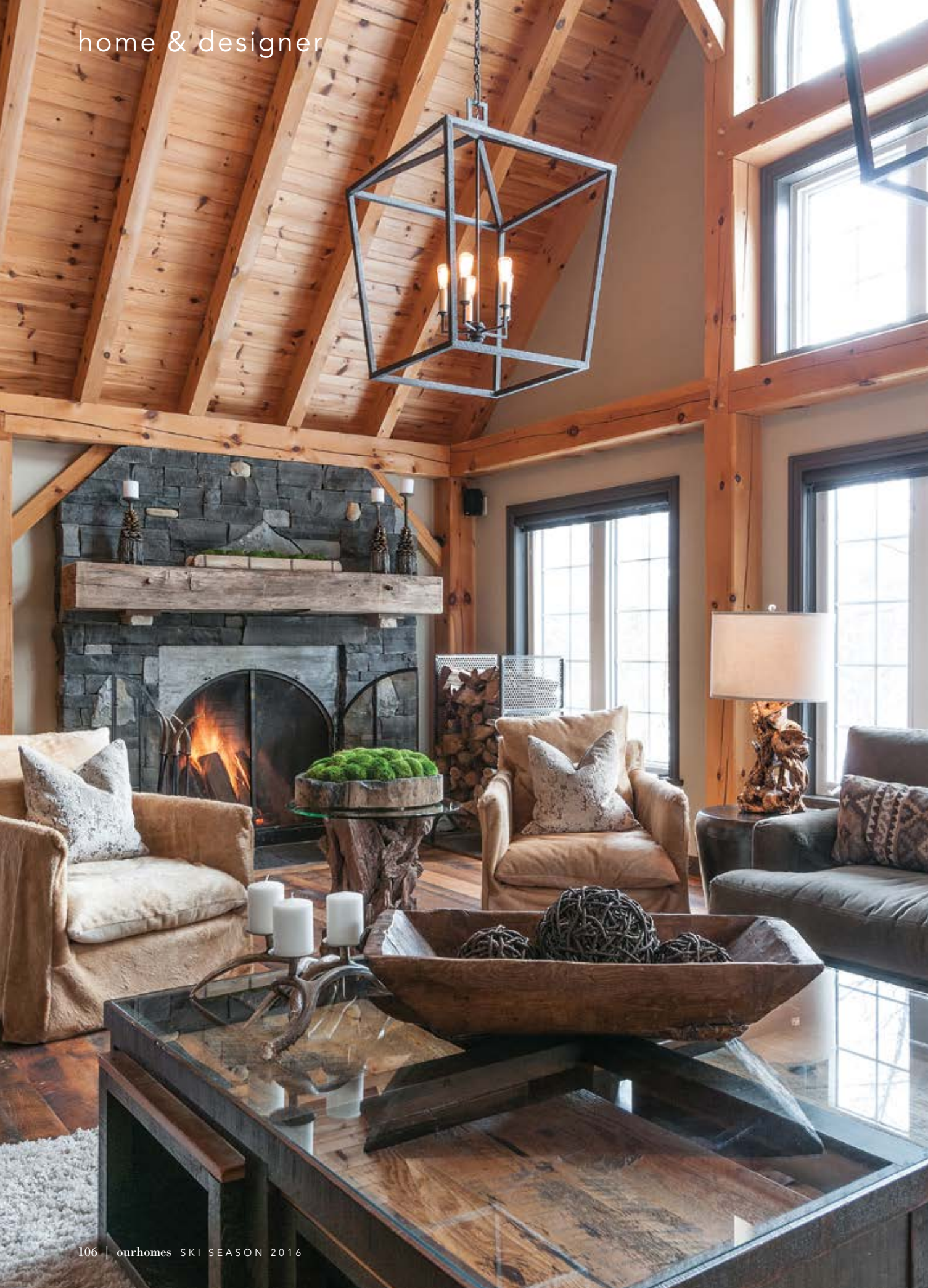
The Normerica chalet features a long deck to enjoy the view. OPPOSITE: Knots in the pine beams and ceiling are drawn out by the dark window frames and stone fireplace in the great room. Metal is featured in accents like light fixtures, tables and a firewood rack.