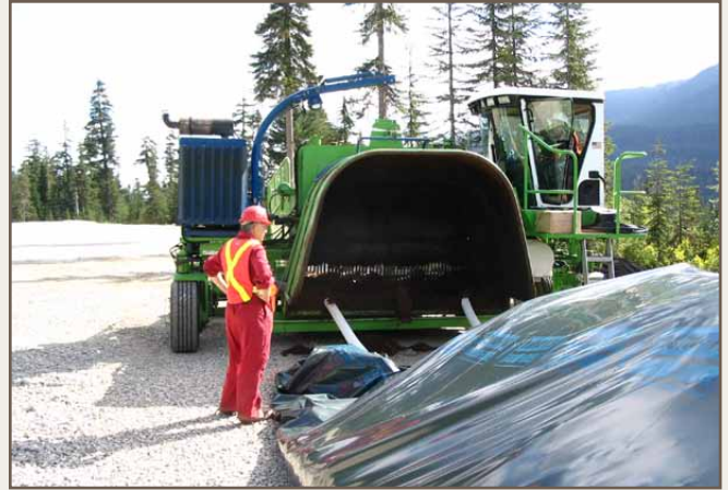
Raw compost is completely enclosed in AG-BAG eliminating leachate and odor issues. Compost under positive aeration. Temperature is monitored under OMRR regulation.