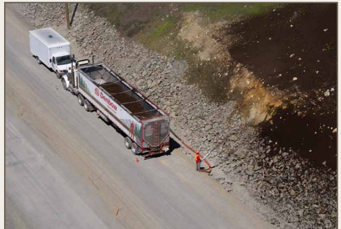
Pneumatic installation and Terraseeding™ of EcoBlanket® for erosion control on soil slopes throughout venue