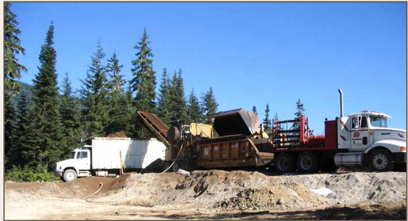
On-site grinding of land-clearings that would have been burned or buried. Mixing-grinding of wood waste (carbon) and nitrogen source prior to composting