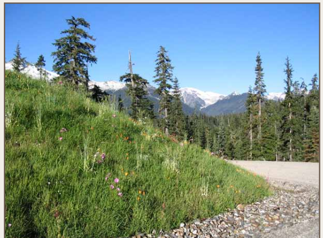
Excellent vegetation and wildflower establishment on the slopes throughout the park and the roadway from the Sea to Sky Highway