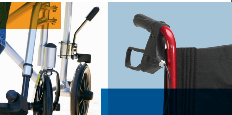
Brakes located on the rear wheels

A combination of handbrakes and rear-wheel brakes can be beneficial, especially if the chair will