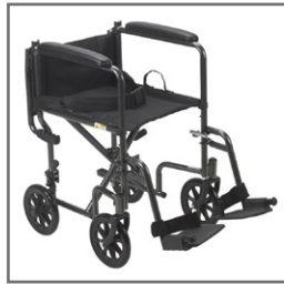
Back folds down for storage and transport