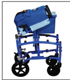
Two way back release which allows this chair to fold easily