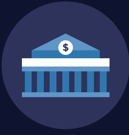
Banks & Financial Services

Cleafy helps any company exposing business-critical on-line services to un-managed endpoints by delivering end-to-end application visibility, continuous threat detection and dynamic protection against Account Takeover, Transaction Tampering and Payment Frauds