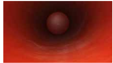
(Photo 1) Interior pitted tank with corrosion prior to ChemLine® application. (Photo 2) Finished tank with ChemLine® coating.