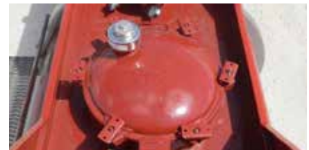
(Photo 3) Manway lid showing corroded rubber lining, due to HCl exposure. (Photo 4) Manway lid and surrounding spill area properly protected with ChemLine® coating.