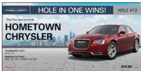
2' x 4' Dealership Personalized Main Prize Sign

PREMIUM ON-COURSE MARKETING TO INCREASE DEALERSHIP VISIBILITY AND TRAFFIC.