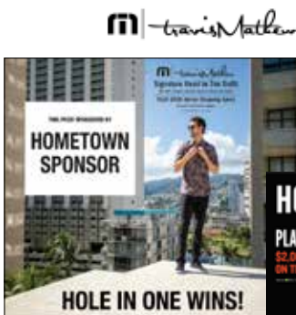
2' x 3' Bonus Prize Signs