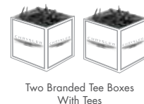
Two Branded Tee Boxes With Tees