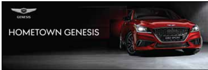
2' x 6' Reusable Dealership Personalized Banner