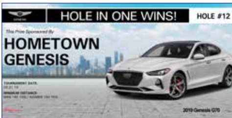
2' x 4' Dealership Personalized Main Prize Sign