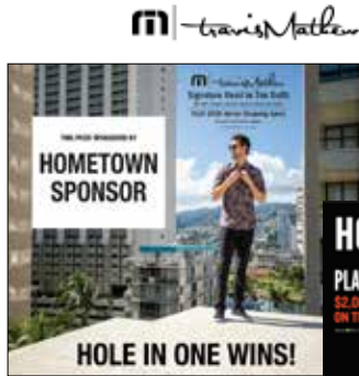
2' x 3' Bonus Prize Signs