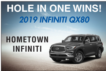
2' x 3' Main Prize Signs