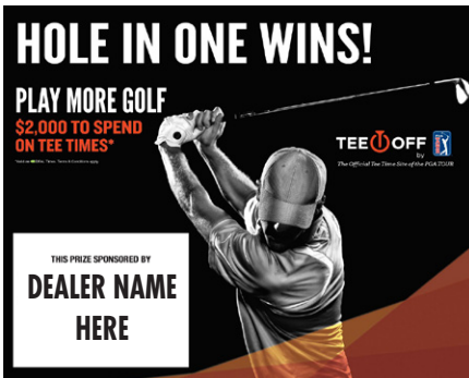
Bonus Prize Signs