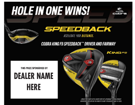
*(Prizes and signs subject to change.)