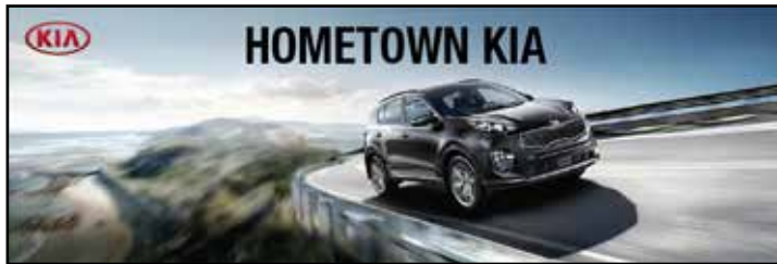
2' x 6' Reusable Dealership Personalized Banner