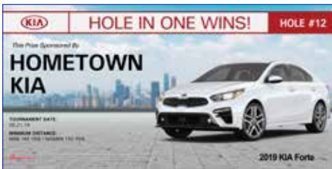
2' x 4' Dealership Personalized Main Prize Sign