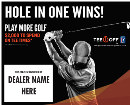
Bonus Prize Signs