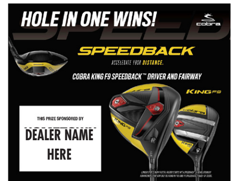
*(Prizes and signs subject to change.)