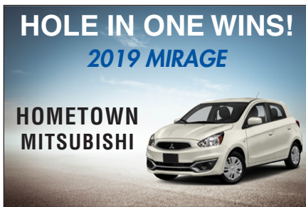
2' x 3' Main Prize Signs