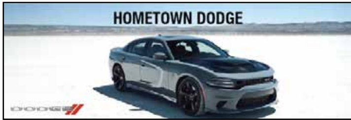
2' x 6' Reusable Dealership Personalized Banner