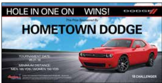
2' x 4' Dealership Personalized Main Prize Sign