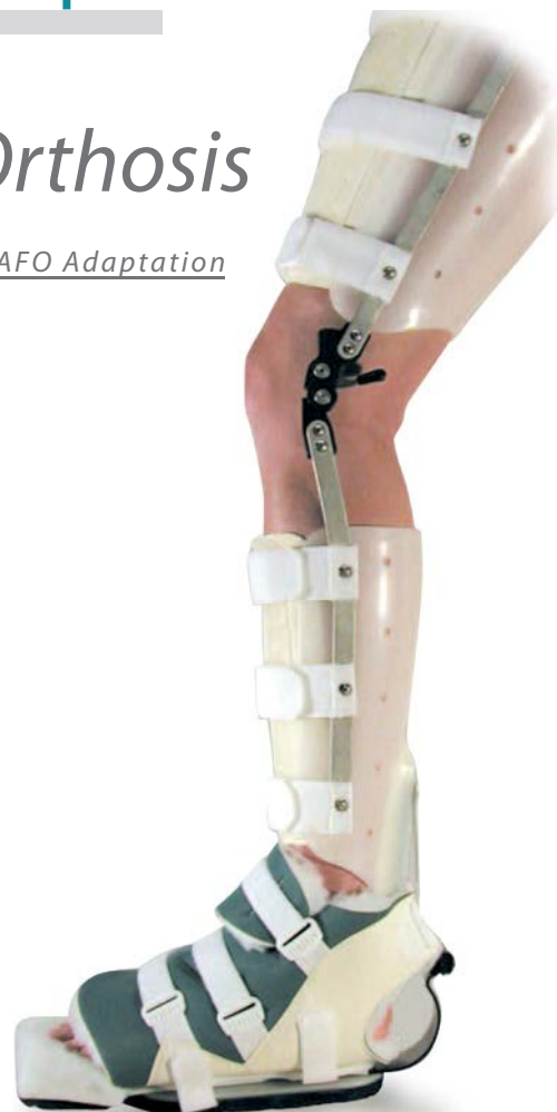
282SKG PKA™ Adult PRAFO®/APU® shown. Pediatric (153SKG) and Infant (050SKG) versions available. Also available with any bar or black liner system.

7. Alternatively, the heel connecting bar can be mounted on the outside to increase relief of the Achilles tendon and heel areas if needed.