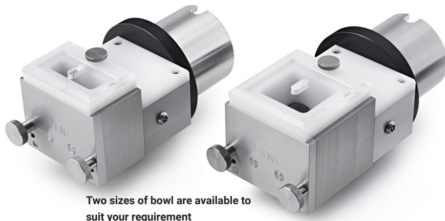
Two sizes of bowl are available to suit your requirement