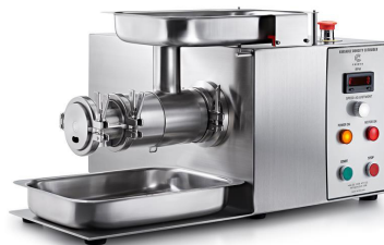
Variable Density Screw Extruder (radial)