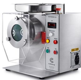
Low pressure screen Extruder 20

The Caleva Datastor-2 can be used* with the Caleva equipment shown below:-