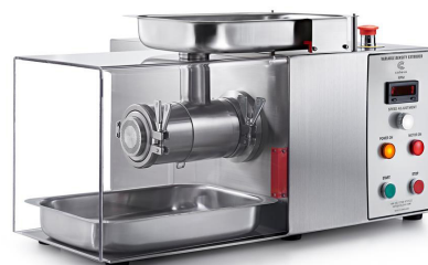
Variable Density Screw Extruder (axial)

*The machines will require and options upgrade at the time of order. The user can use any modern PC or laptop. The software is supplied free of charge to users of compatible machines.