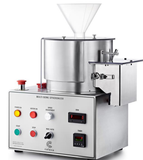
MBS Spheronizer 250