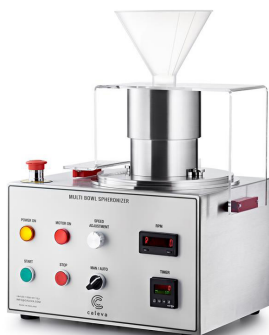
MBS Spheronizer 120