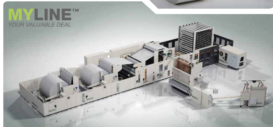
*Parent reel changeovers excluded. In a test condition lasting up to 8 hours without product changeover, with the line adjusted and operated by Fabio Perini technicians. The efficiency of each line will be exclusively set forth under the individual supply agreements and it may vary depending on the type of product being produced, the machine units included in the line and the quality and consistency of raw materials.

The 3 line configurations include important solutions for flexibility and safety, such as the innovative line access system "Access 2.0" and other elements such as the double-perforation system on the rewriter and the grinding dust vacuum system on the log saw.