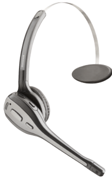
CT40 mobile computer with Honeywell Guided Voice application and SRX SL headset

» Click Here to learn How to Clean Honeywell's General-Purpose Scanners and Disinfectant-Ready Products