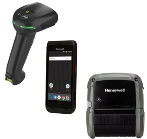
Xenon XP 1952-g-bf scanner, CT40 mobile computer and RP4e mobile printer

Switching to a curbside model allows for their shoppers to get the products they need while adhering to social distancing recommendations. 4