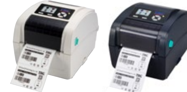
Model_ TC Series

TC Series features four models to suit your needs and budget. It includes LED versions (TC200 and TC300) and color LCD versions (TC210 and TC310). The design represents TSC's innovation and commitment to user experience. With its compact construction, the TC Series is designed for high performance. The print speed can go up to 6 inches per second and reach a 4 inch wide label print width, appropriate for medical examination documents. The addition of the color screen gives users a clearer and easier way to access operational information. TC series remains the best choice on the desktop label printer market because of its durability, performance and speed.