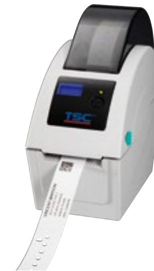
Model_ TDP-324W Series