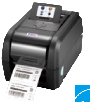
Model_ TX200 Series