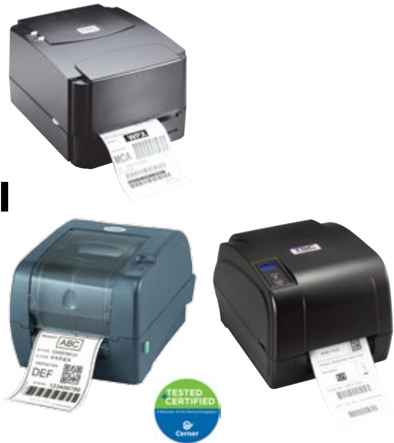
Recommended Models_ TTP-244 Pro, TTP-247, TA210

Major medical institutions have been working diligently to ensure the safety of patient's medication, further enhance medical efficiency, and to prevent medical negligence. The most urgent matter at stake, is to avoid misdiagnosis and secure complete and accurate patient medical information. Another important matter to address is the misuse of prescription drugs due incorrect administration to misinterpretation of the prescription. These can be solved just by installing a barcode identification system.