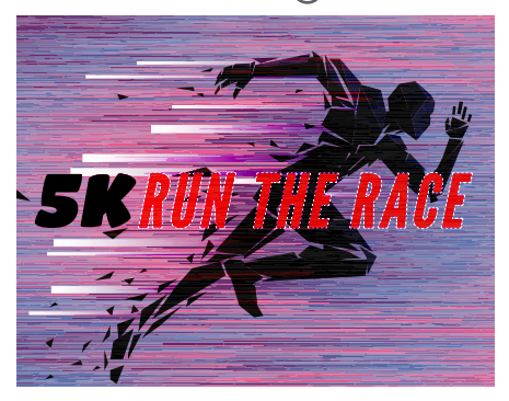
JUNE & JULY