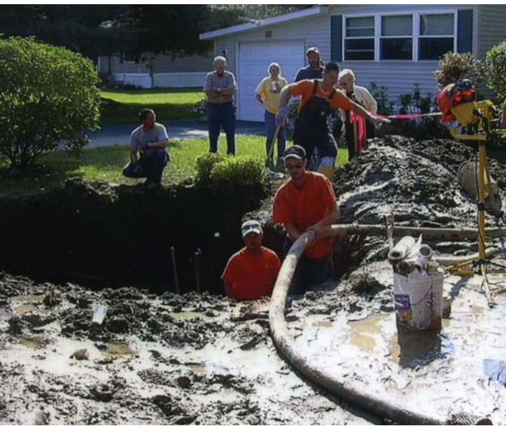
Residents of the Northway Estates look on as the crew from John Lucarelli & Sons repair a leak in the water main.