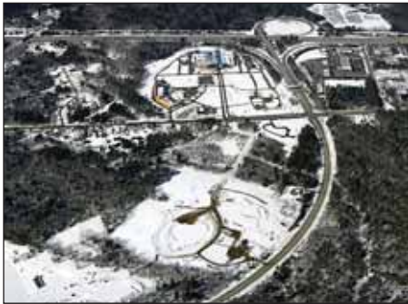
35-acre Cabela's site in Scarborough, ME.

We all know that Team EJP knows water. What some people may not know is that when it comes to moving that water through sensitive areas, EJP is on the