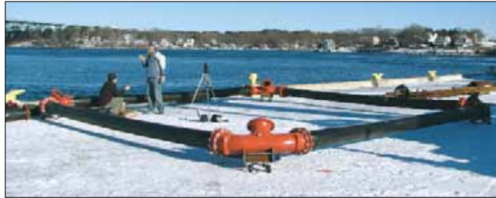
At right is the layout of the base frame for the FISH CAGE. The layout has to be accurate, and the welding MUST be per dimension as indicated by the “plan” details.

To build these cages, they used HDPE Pipe, special fittings and large fishing nets. They were all fused together using a unique fusion pattern. Team EJP was asked to supply the pipe and do the fusion work. We gladly accepted the challenge, and the results were amazing as you can see from the photos.