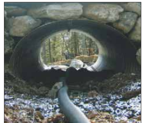
Finished site at Camp Hi-Rock in Mt. Washington, MA.