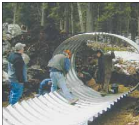
Installing the 30' box culverts.

Another environmentally oriented project involved running two 30' box culverts at Camp Hi-Rock in Mt. Washington, MA through existing wetlands. Joe Wilkinson Excavating of Sheffield, MA was the contractor using culverts manufactured by Contech of Palmer, MA and supplied by Team EJP of Springfield, MA. Together we got the project up and "running".