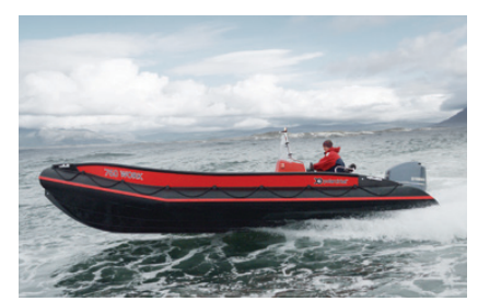
The 785 and 845 models are offered with new hull design, which gives better lift, and forces the spray out to the sides.