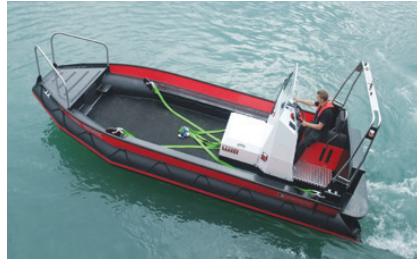
Open Workboats are also available with inboard diesel engines from 130-300Hp. The inboard series ranges from 6,60 to 8,45 meters.