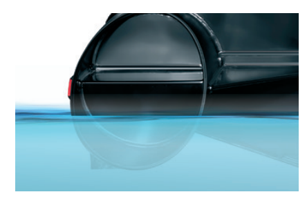
Smart details such as sloping pontoons with integrated steps, make it easier to get back onboard from the water.