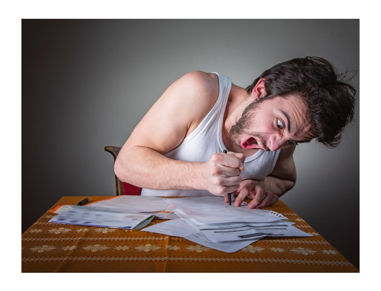
TAXES LOWER DURING RETIREMENT?