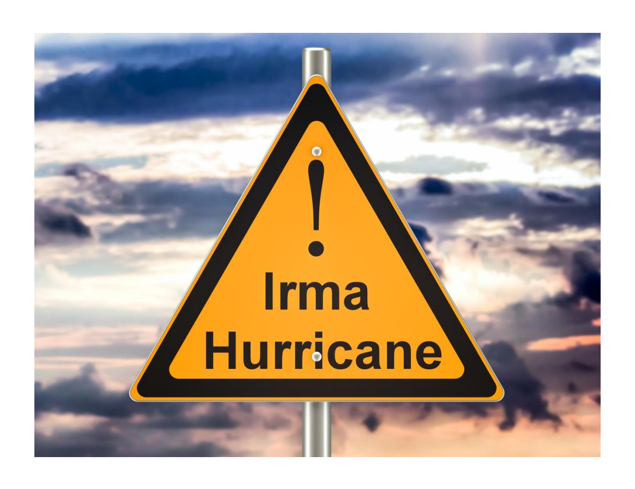
SOCIAL SECURITY AND MEDICARE