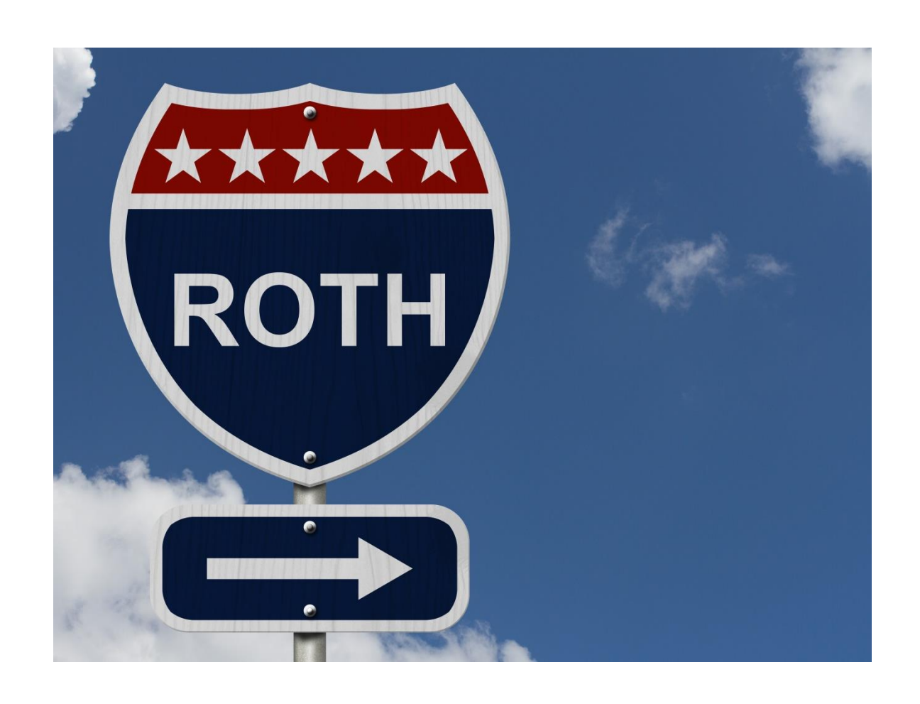
ROTH 401(K) AND ROTH IRA