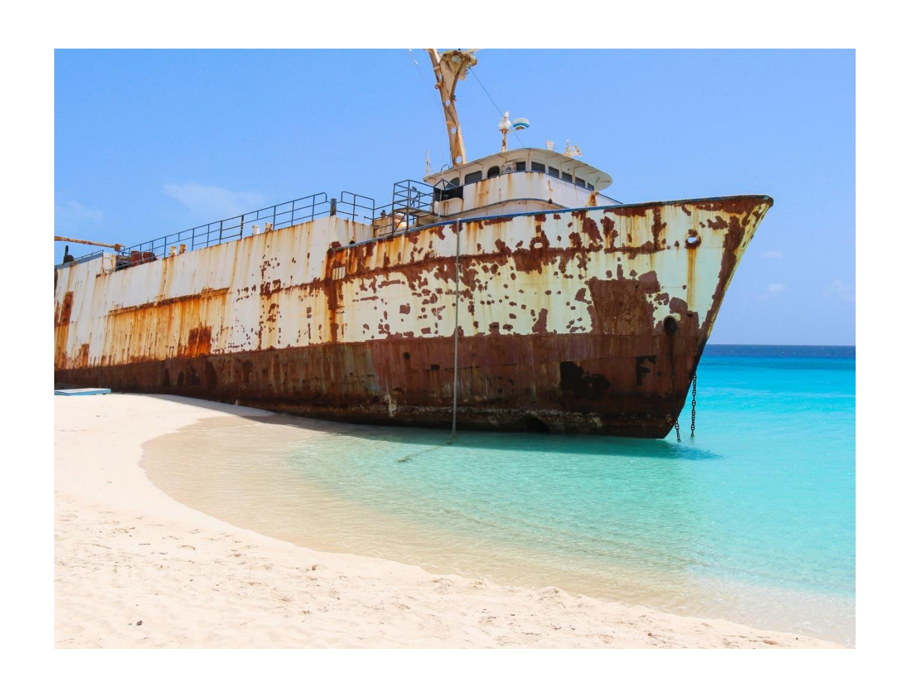
SEQUENCE OF RETURNS IGNORED