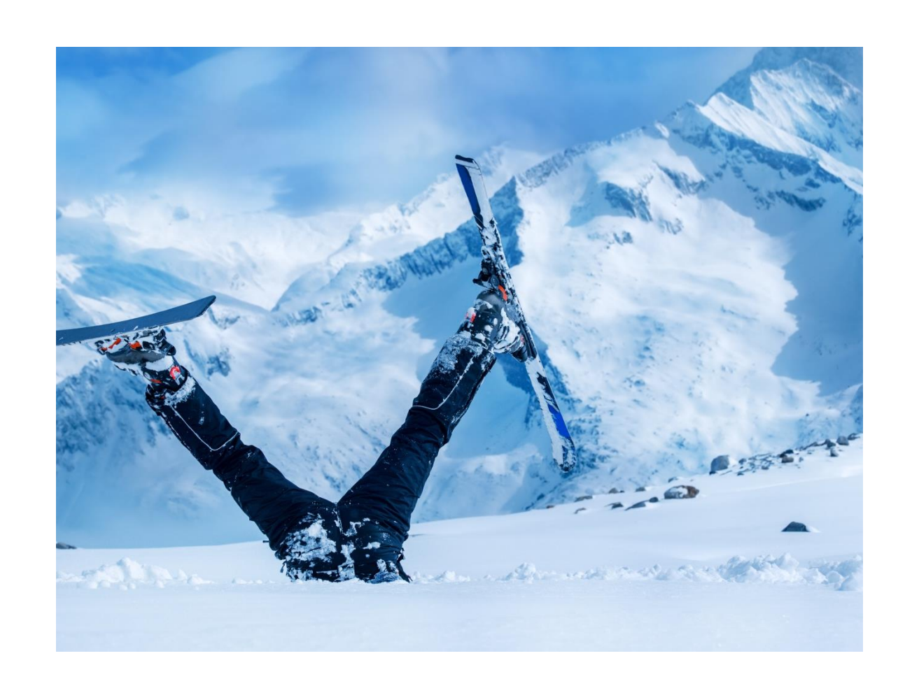
NO DISTRIBUTION STRATEGY