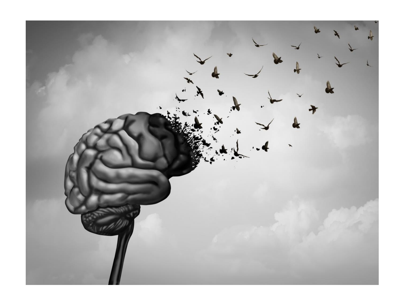
LONG TERM CARE POLICY LAPSES