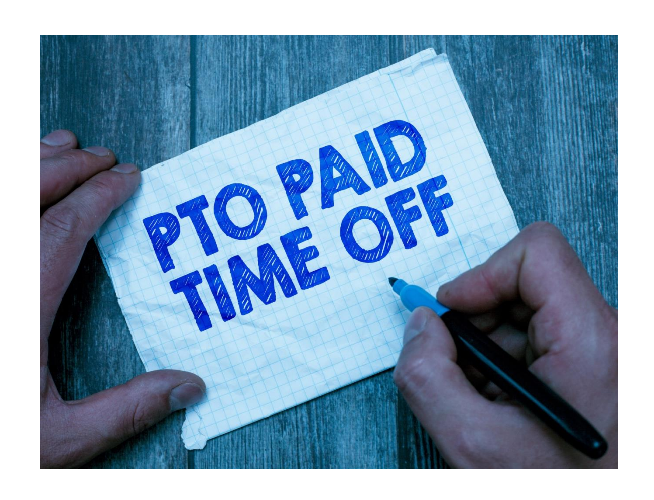
SICK PAY PLANS