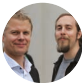
LIMES AUDIO sold to GOOGLE