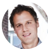
PRODIGY FINANCE growth round INDEX VENTURES