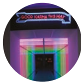
KARMARAMA sold to ACCENTURE