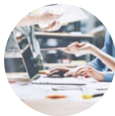
SEQUENCE sold to SALESFORCE