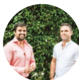
MEDIA IQ investment from ECI