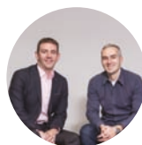
AQUILA INSIGHTS sold to MERKLE