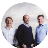
BULLITT investment from EXPONENT