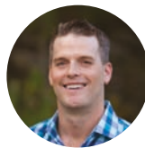
VEMORY sold to GOPRO