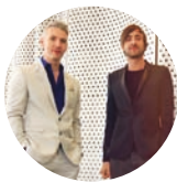
THE BIO AGENCY sold to TECH MAHINDRA