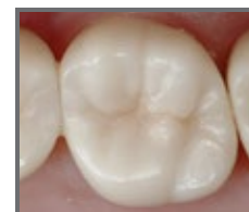
BruxZir 3Y At 8 Years (Note loss of glaze)