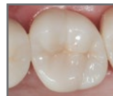
BruxZir 3Y 2009 Initial Placement

Over 200 tooth-colored materials have been studied clinically by this lab over the last 40+ years. The current study includes 20 materials at various stages of clinical service ( see listing on page 2 ). The materials differ in many aspects, but all are tooth-colored, monolithic, CAD-CAM fabricated either by commercial labs or in-office; all were recommended for single units anywhere in the oral cavity when entered into this study; and all study restorations are full-contour crowns on molars.