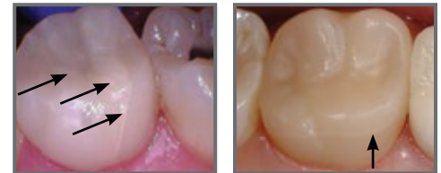
Celtra DUO Non-Fired crack appearance

TRAC Research CONCLUSIONS: It is too early in the service life to reach final conclusions on many of the products in this large diverse study. However, after just one to two years, several materials are no longer sold ( BruxZir Anterior, BruxZir NOW 2016, Pavati Z40.1 ) and several others are no longer recommended for full-contour molar crowns ( cubeX 2 , Lava Ultimate ).