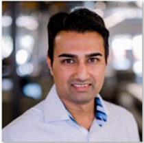
Poornaprajna Udupi - 250 x 250.png