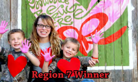
Region 7 Winner