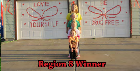
Region 8 Winner