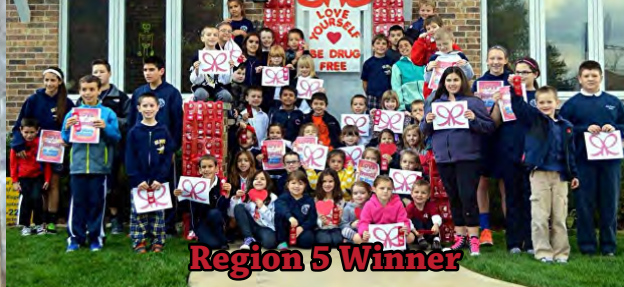
Region 5 Winner