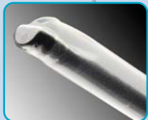
with sterile, disposable EndoSheath® Technology