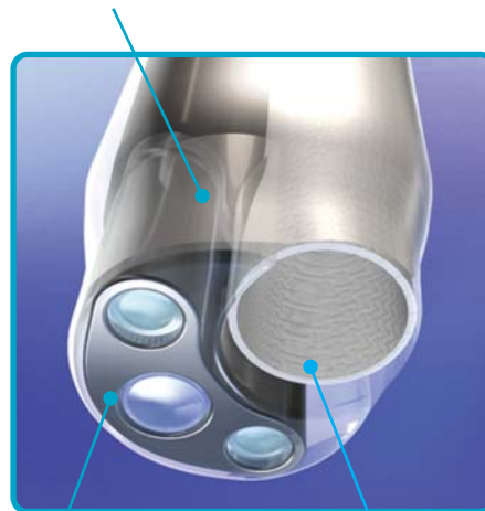
A reusable endoscope

Sterile, durable, disposable Microbial barrier