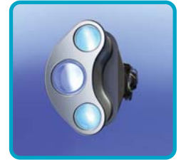
Unique "D-Shape" endoscopes