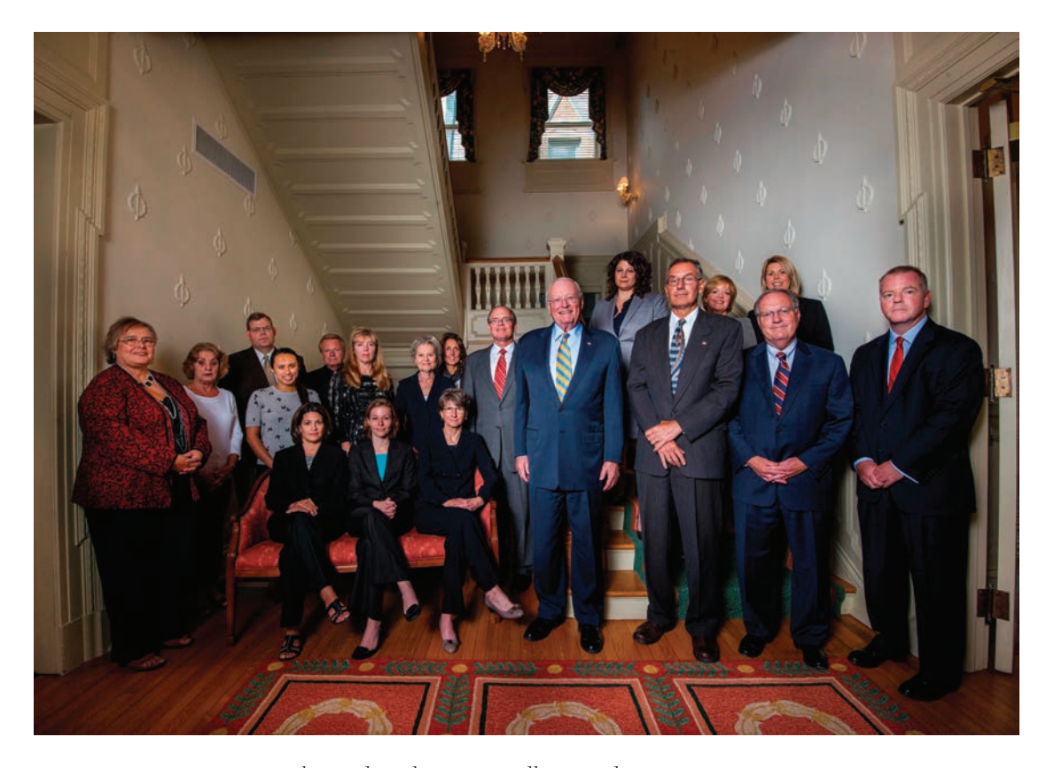
The Lynde and Harry Bradley Foundation Staff