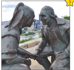
Point of View Statue by Jim West This bronze statue depicts George Washington and the Seneca leader Gaysusuta in a face-to-face meeting in 1770.