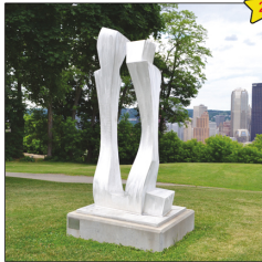
Statue Untitled by Jim Myford Originally commissioned by a juried competition for the Carnegie Library in 1973 and later restored and placed in the Park in 2010.