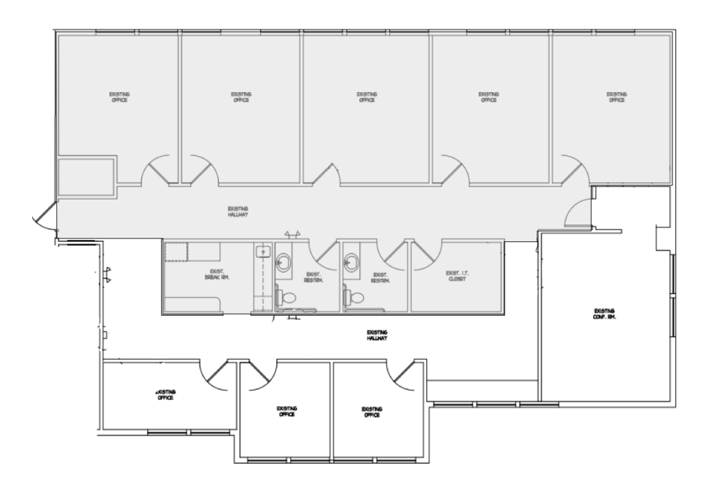
Suite 300 - 2,012 Rentable Square Feet