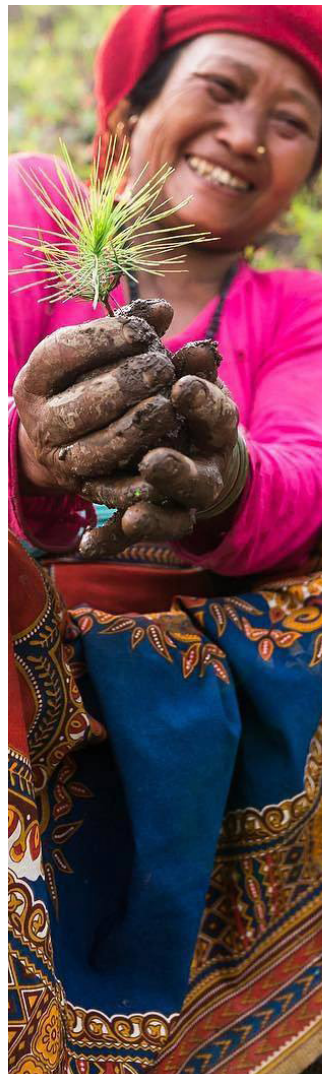
Laxmasthan Village Nepal