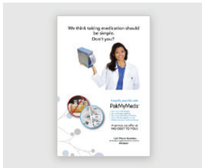
5" x 8"