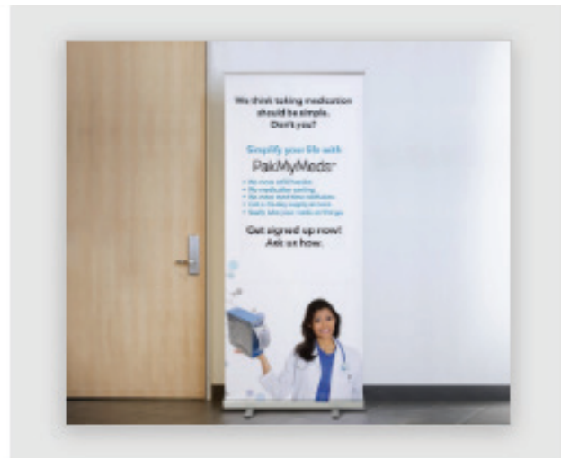
Retractable, 34" x 81"