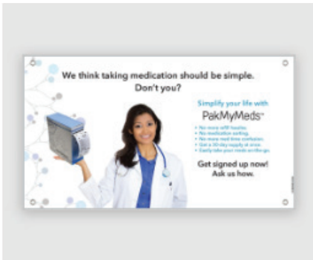
Vinyl with grommets, 3' x 1.7'