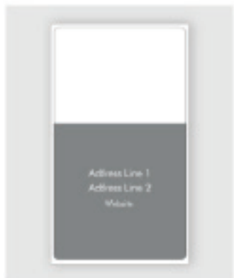
Grey Matte, 3.5" x 2"