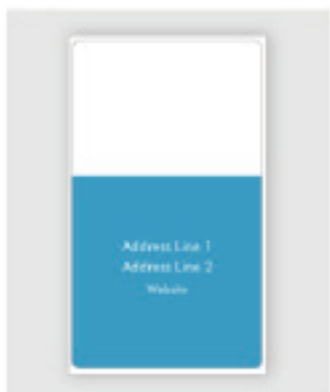
Teal Matte, 3.5" x 2"