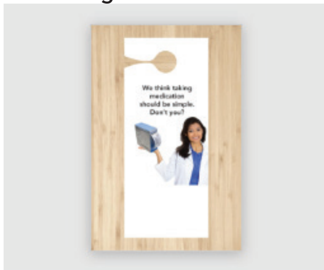
Front & Back, 3.5" x 8.5"