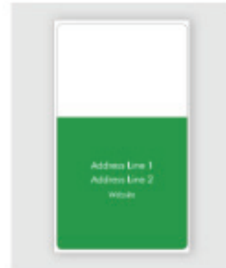
Green Matte, 3.5" x 2"