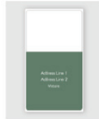
Dark Green Matte, 3.5" x 2"