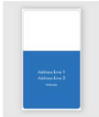
Blue Matte, 3.5" x 2"