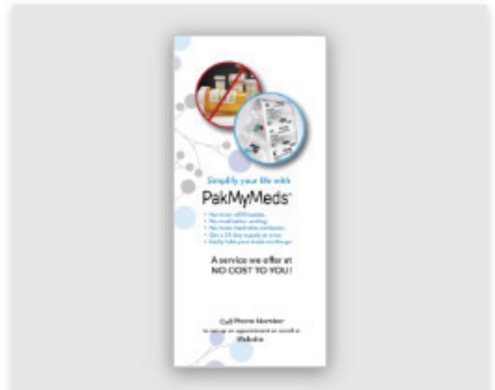
Front & Back, 3.75" x 8.25"