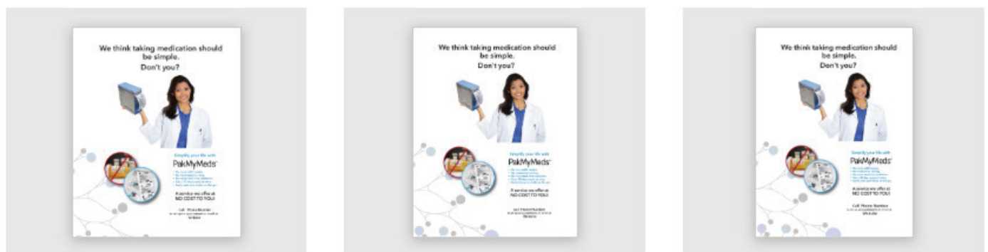
16" x 20"