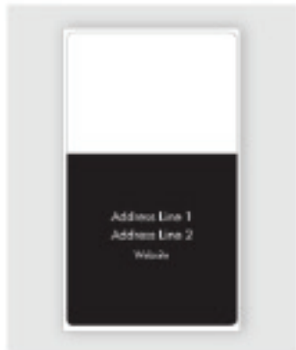
Black Matte, 3.5" x 2"