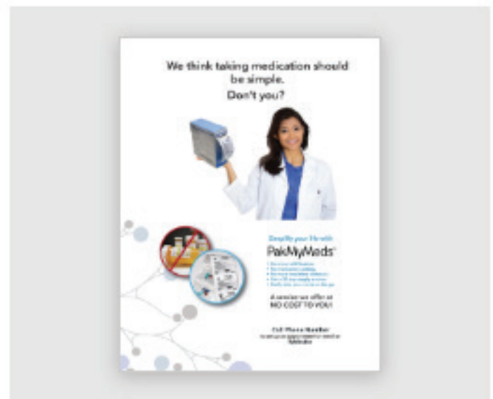
8" x 11"