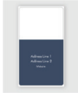
Navy Matte, 3.5" x 2"