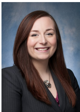
Director of Multiple Listing Systems at GKAR (269) 382-1985

In the event you receive an email notification that the battery is dying, or you come upon the lockbox and it simply won't light up after trouble shooting, you'll need to collect replacement batteries and possibly an external Power Port kit. These can be found at your office or GKAR.