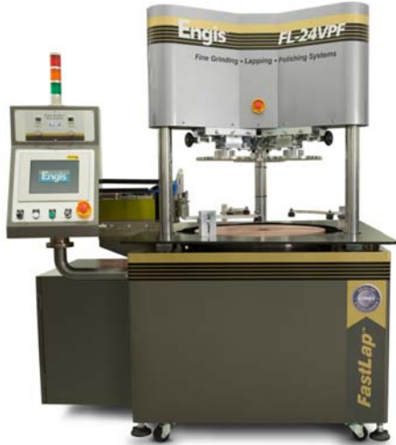
Model FL-24VPF (Pneumatic) shown above with optional Plate Facing and built-in Hyprez Minimiser/Auto Dispensing System