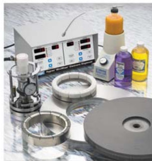
Full line of Hyprez® Slurries, Accessories, Lap Plates and Dispensing Systems are available