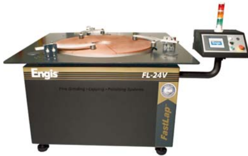
Model FL-24V Non Pneumatic (Hand Weight)

Versatility and speed are the hallmarks for the newest line of Engis lapping and polishing machines.