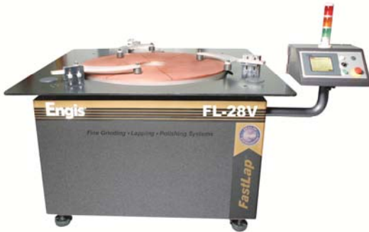
Model FL-28V Non-Pneumatic (Hand Weight)

Versatility and speed are the hallmarks for the newest line of Engis lapping and polishing machines.