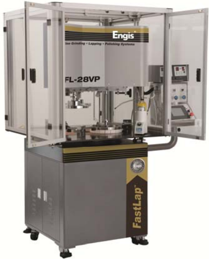
Model FL-28VP (Pneumatic) shown above with optional Dust Cover & Hyprez Minimiser/Auto Dispensing System