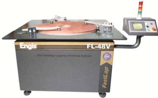
Model FL-48V Non-Pneumatic (Hand Weight)

Versatility and speed are the hallmarks for the newest line of Engis lapping and polishing machines.