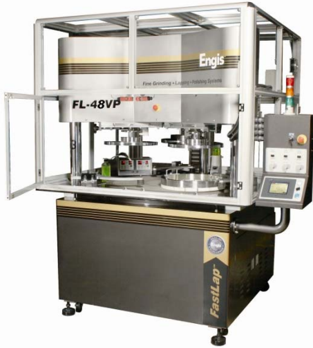
Model FL-48VP (Pneumatic) shown above with optional Dust Cover