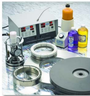
Full line of Hyprez ® Slurries, Accessories, Lap Plates and Dispensing Systems are available