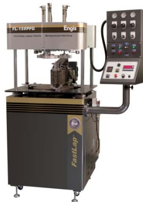
Model FL-15VPF (with Plate Facing)