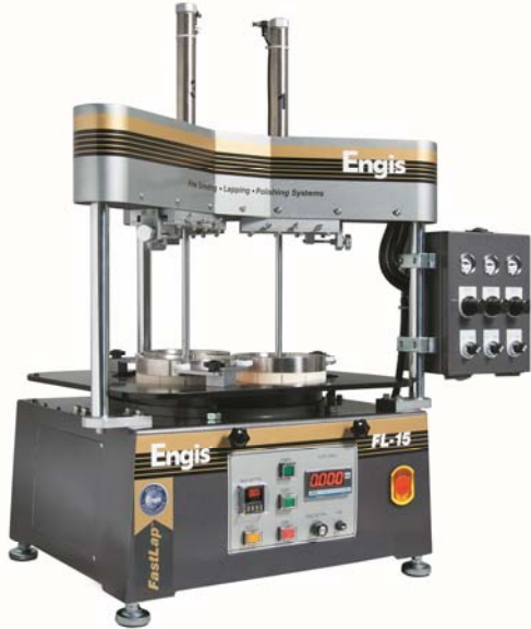
Model FL-15VP (Pneumatic) shown above. Model FL-15V (Hand Weight) shown below.