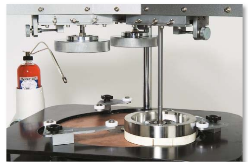
Full line of Hyprez® Slurries, Accessories, Plates and Dispensing Systems are available