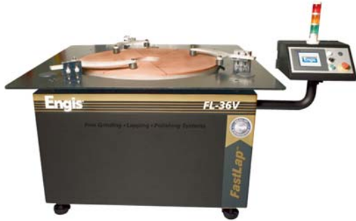
Model FL-36V Non-Pneumatic (Hand Weight)

Versatility and speed are the hallmarks for the newest line of Engis lapping and polishing machines.