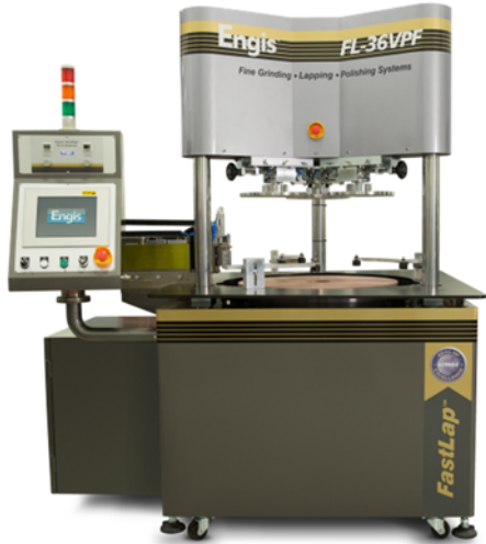
Model FL-36VPF (Pneumatic) shown above with optional Plate Facing and built-in Hyprez Minimiser/Auto Dispensing System