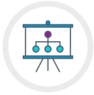
Offer & Order Management

Offer & Order Management: Streamline shopping, booking, and data management based on a catalogue of air cargo services.