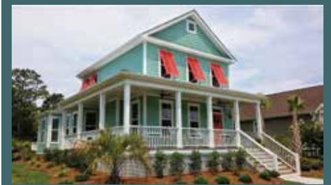
THE SEABREEZE COTTAGE 4.0 BED | 2.5 BATH 2,549 SQFT