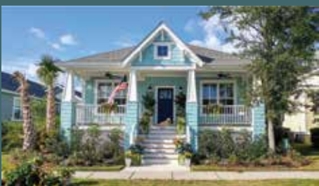
THE SEASIDE COTTAGE 3.0 BED | 2.0 BATH 1,601 SQFT