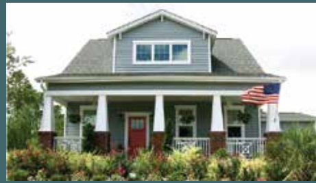
THE SAND DUNE COTTAGE 3.0 BED | 2.5 BATH 2,035 SQFT