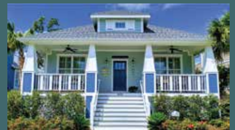
THE SANDFIDDLER COTTAGE 3.0 BED | 2.0 BATH 1,728 SQFT