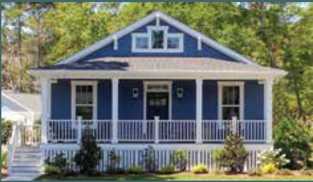
THE SEASHELL COTTAGE 2.0 BED | 2.0 BATH 1,359 SQFT