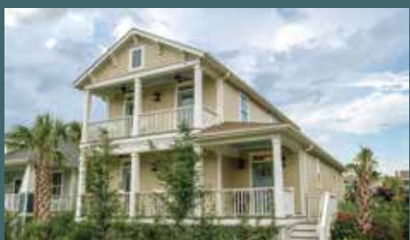
THE SWEETWATER COTTAGE 3.0 BED | 2.5 BATH 2,144 SQFT