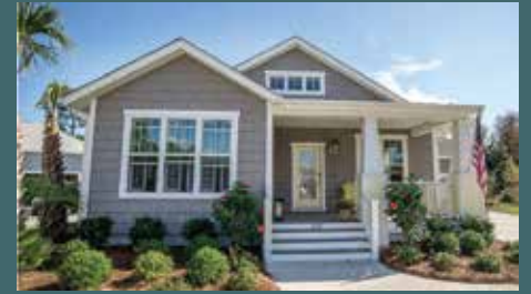
THE SURFSIDE COTTAGE 3.0 BED | 2.0 BATH 1,553 SQFT