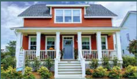
THE WATERSIDE COTTAGE 3.0 BED | 2.5 BATH 1,890 SQFT