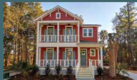
THE TIDEWATER COTTAGE 4.0 BED | 3.0 BATH 2,218 SQFT