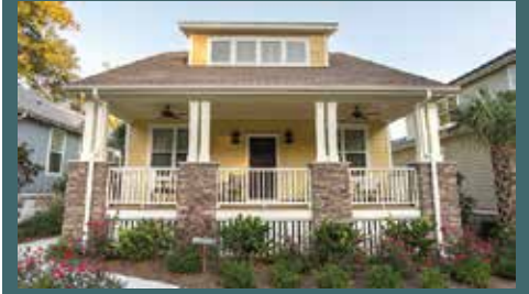
THE WINDSONG COTTAGE 3.0 BED | 2.5 BATH 2,120 SQFT