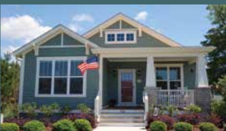
THE SAND PEARL COTTAGE 3.0 BED | 2.0 BATH 1,854 SQFT

* 1-STORY PRICING STARTING IN THE MID $200'S | NOT INCLUDING LOT COST * FLOOR PLAN AVAILABILITY AND PRICING SUBJECT TO CHANGE PER LOCATION