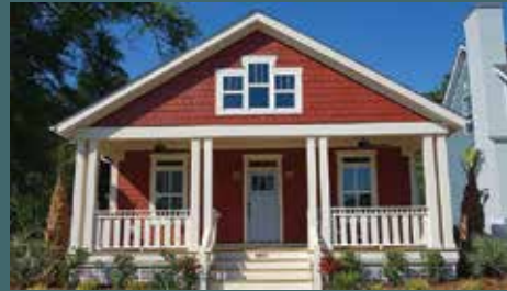
THE SUNSET COTTAGE 2.0 BED | 2.0 BATH 1,453 SQFT