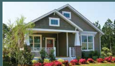
THE SEA STAR COTTAGE 3.0 BED | 2.0 BATH 1,652 SQFT