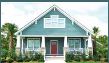
THE SEAHAVEN COTTAGE 4.0 BED | 3 BATH 2,613 SQFT

* 2-STORY PRICING STARTING IN THE MID $300'S | NOT INCLUDING LOT COST * FLOOR PLAN AVAILABILITY AND PRICING SUBJECT TO CHANGE PER LOCATION